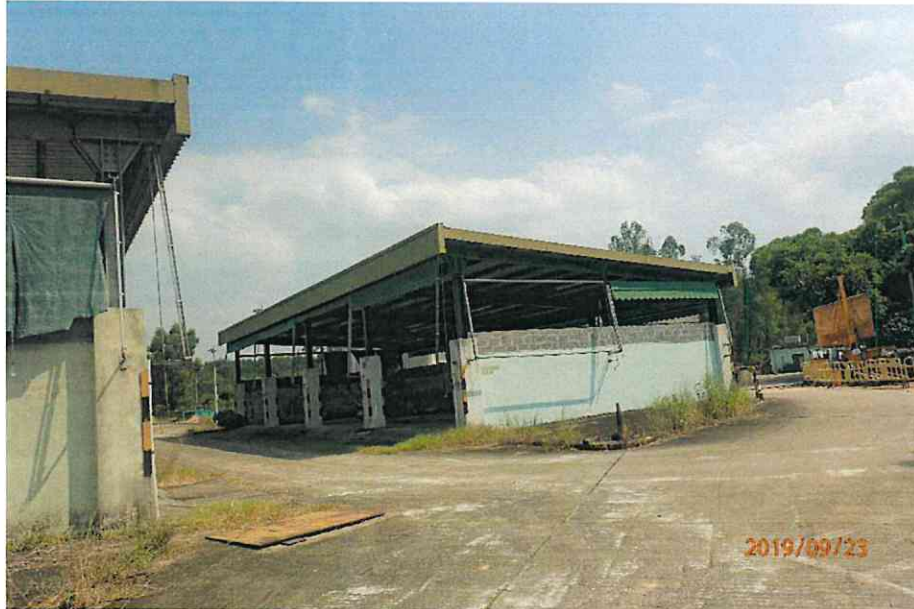
Photo no.1 - Developed Area