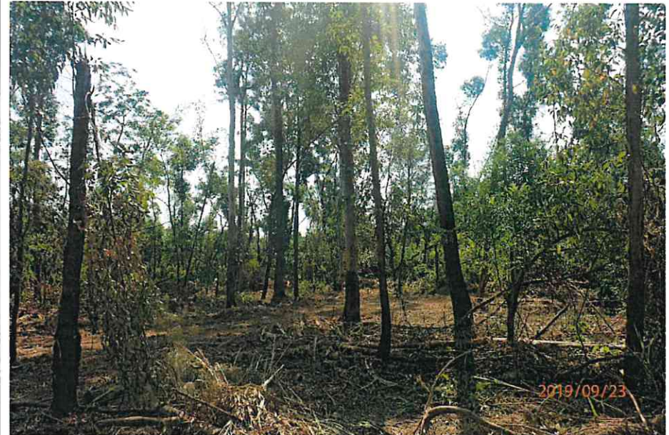
Photo no.2 - Plantation